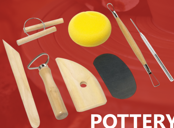
POTTERY TOOLS SET